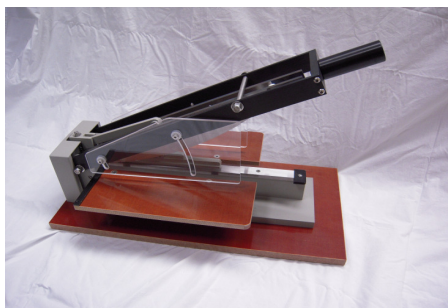
Model DT-1012 Laboratory Sample Cutter with Optional Base, Cutting Platforms (2), and Safety Shields (2) Installed

Our applications knowledge and engineering depth allow us to offer both standard and custom systems based on industry-leading technology.